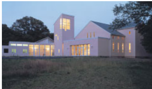
Above View of the new sanctuary.